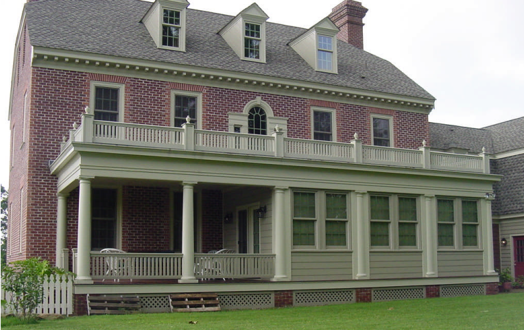
Rear porch with mahogany deck boards and old style railing and enclosed sunroom.