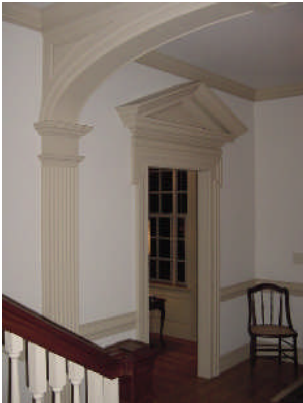
Millwork in the front entry hall.