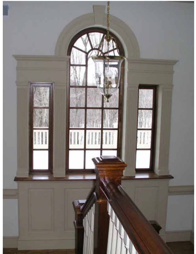
Palladian window on main stair landing.